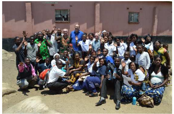
After a goodbye from the Lusaka Church we head off to pick up our luggage and around 13:00 we set off to the airport to start our flights back to the UK.