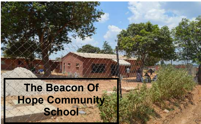
The Beacon Of Hope Community School

A typical school day starts at 08:00 and runs to 10:40 where there is a 20 minutes break, then 11:00 to 13:00 where lunch is served. On the day of our visit lunch was chicken, spinach and nshima. After lunch classes start again at 14:00 through to 15:45.