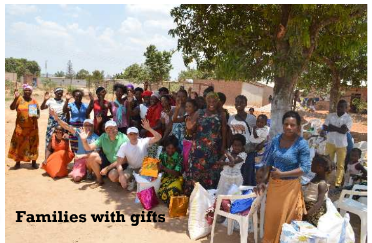
Families with gifts