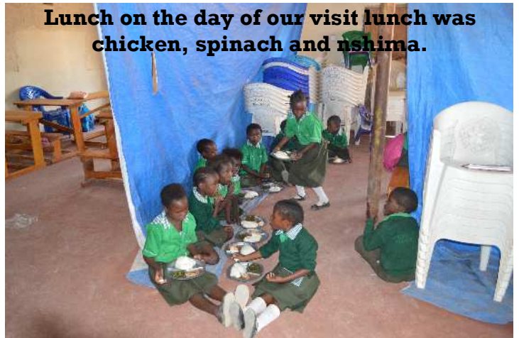
Lunch on the day of our visit lunch was chicken, spinach and nshima.

A typical school day starts at 08:00 and runs to 10:40 where there is a 20 minutes break, then 11:00 to 13:00 where lunch is served. On the day of our visit lunch was chicken, spinach and nshima. After lunch classes start again at 14:00 through to 15:45.