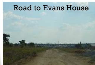
Road to Evans House

Leaving the school was emotional. However we had to leave as we were heading off to see Evans house.