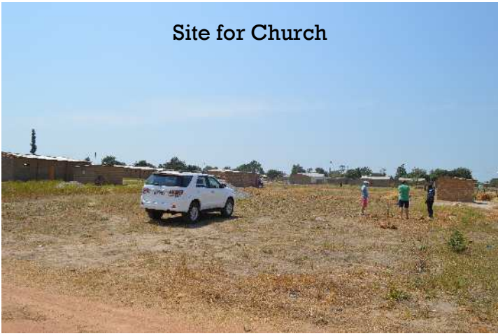
Site for Church

We turned up in the middle of classes where children were learning English and about English weather.