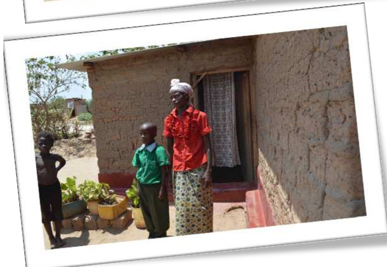
After the visit to the school we were able to visit some of the children's home that were near by.